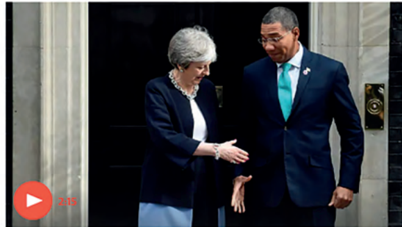
▲ Theresa May apologises for treatment of Windrush generation - video

Theresa May has apologised to the 12 Caribbean heads of government for the treatment of Windrush citizens and promised that no one would be deported.