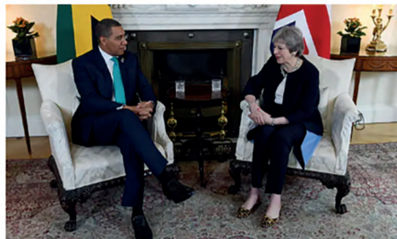
▲ Theresa May with the Jamaican prime minister, Andrew Holness, at Downing Street on Tuesday.

She added: "We would also like to reassure you that there will be no removals or detention as part of any assistance to help these citizens get their proper documentation in place."